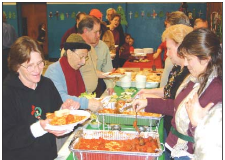
Grown ups had as much fun as the children at the Tower Hill Neighborhood Association's party.