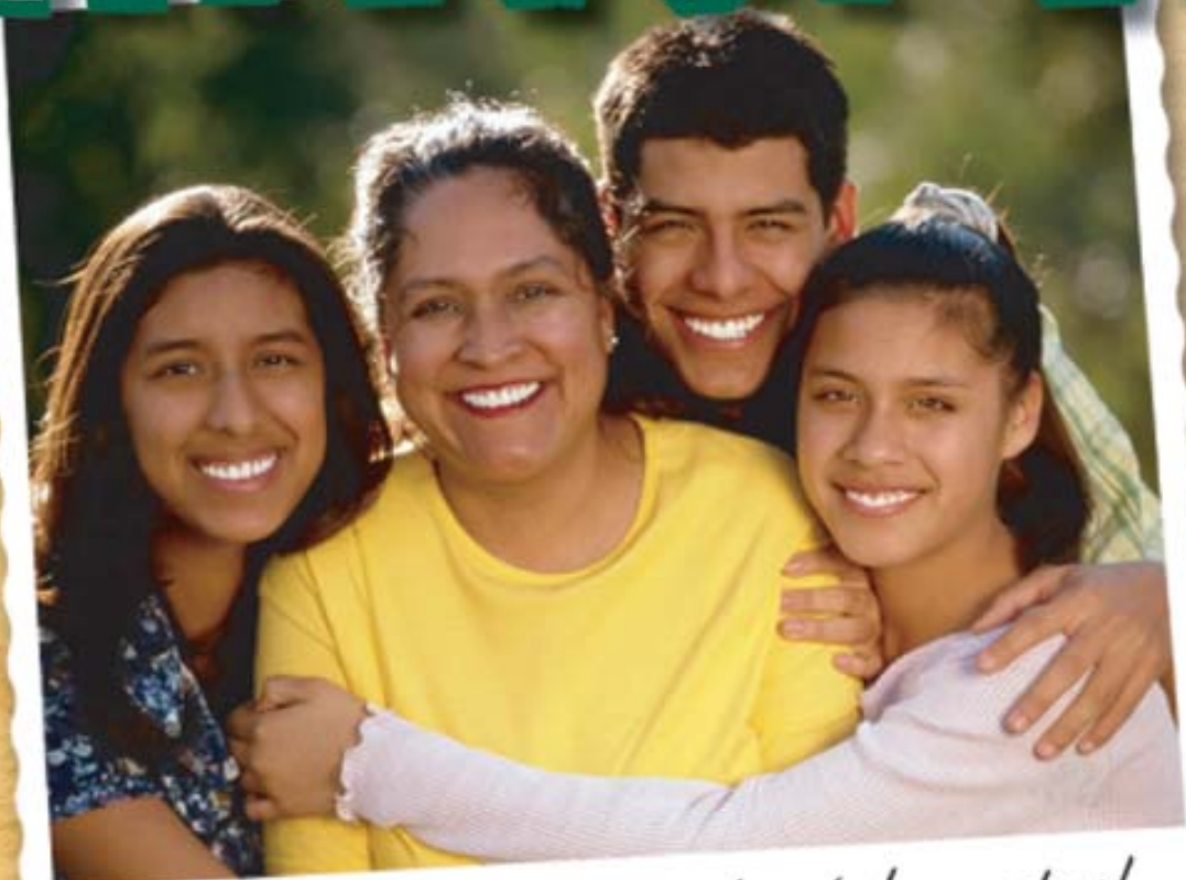
Cumpleaños de mamá. ¡cuántas velas!