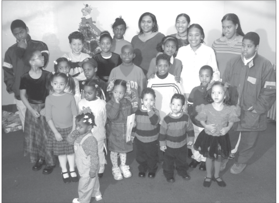
Group of children attending the Haitian Cultural Group Christmas celebration.