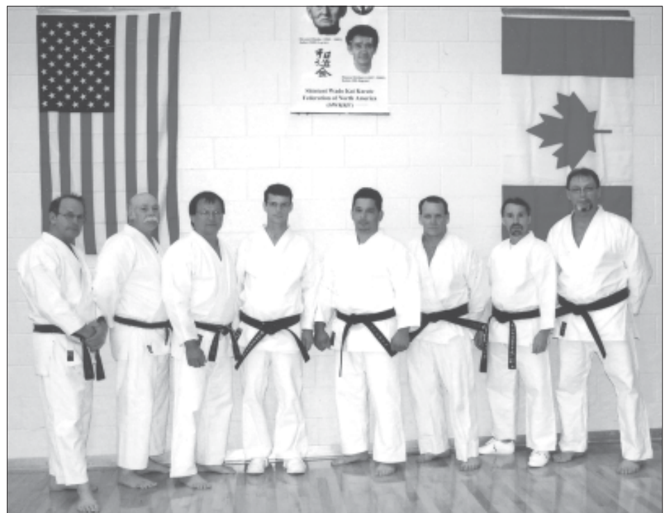
El Comité canadiense encargado del estilo Shintani Wado Kai Federation.