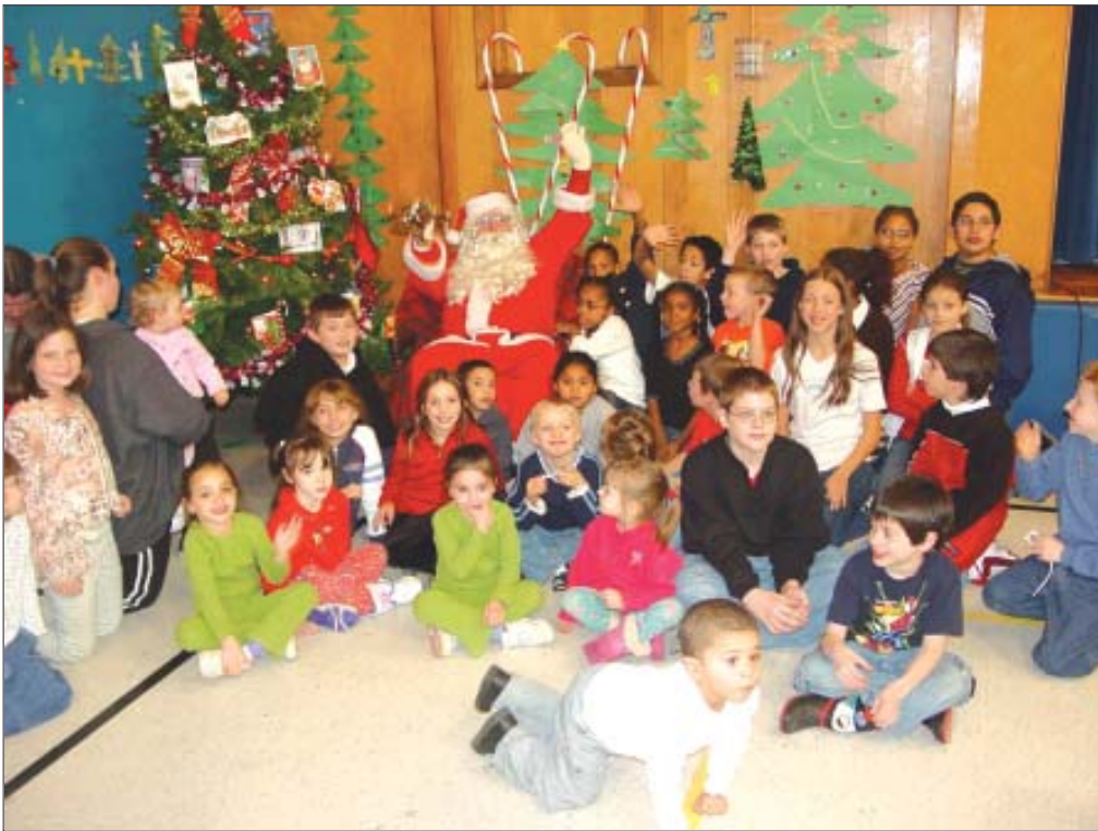
Santa rodeado de un numeroso grupo de pequeños. Cada uno de estos niños recibió un juguete.