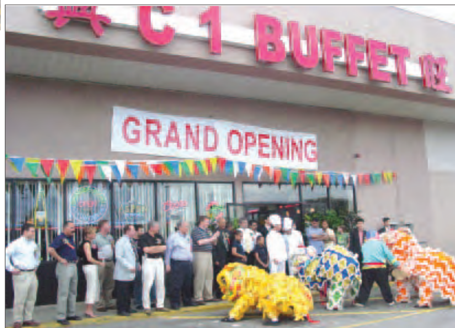
The dragons greeting the visitors.