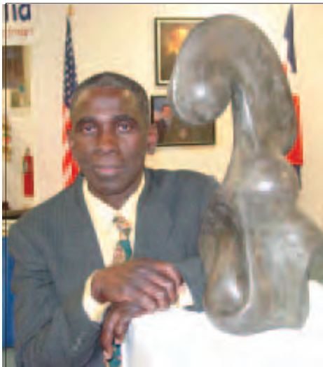
El autor con "Forma Infinita", escultura hecha a base de fibra de vidrio y resina de poliéster coloreada con polvo de cobre.

La exposición, titulada "Cuando la humanidad pueda volar", está compuesta de más de 20 pinturas donde el objeto principal es un ave en vuelo. Esto no es una coincidencia, sino el propósito de su arte. Cabral opina que el pájaro es un símbolo de libertad. "Es el animal que es