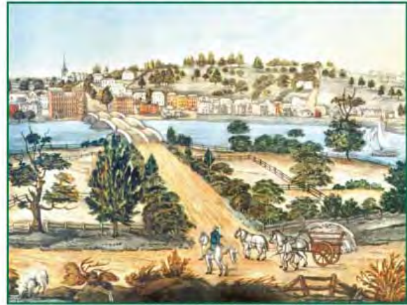
THE VALLEY AND ITS PEOPLES

Reading and signing the newly revised edition of his popular illustrated history.