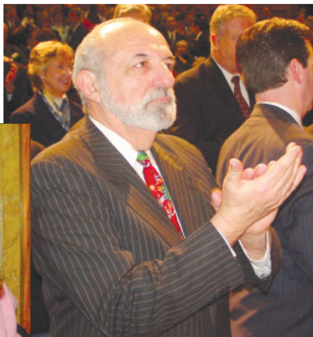
Boston City Councilor Felix Arroyo approved the election of the new Speaker of the House.