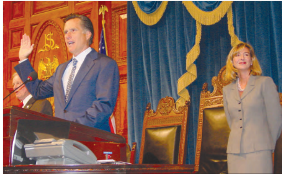
Governor Mitt Romney during the swearing in ceremony of the 184 th General Court. Lieutenant Governor Kerry Healey is behind him.