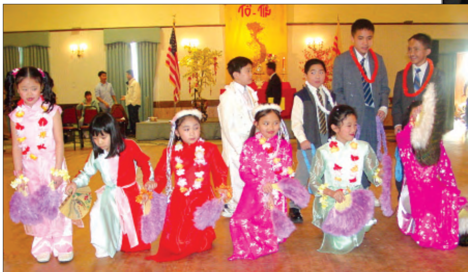
Grupo de niños, ataviados en sus trajes típicos, al terminar una danza, saludan al público. Dressed in costumes, children bow to the audience after performing a dance.