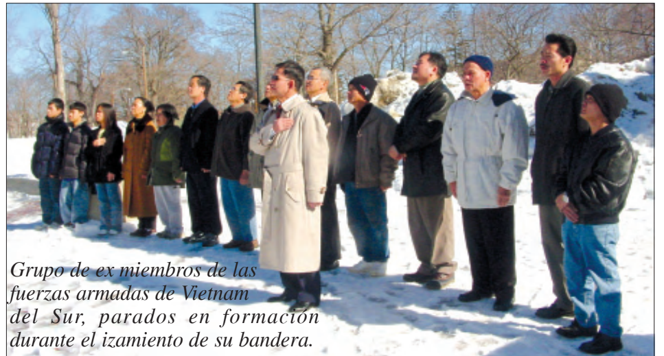
Standing in formation, a group of former members of the South Vietnam's Armed Forces during the flag raising ceremony.