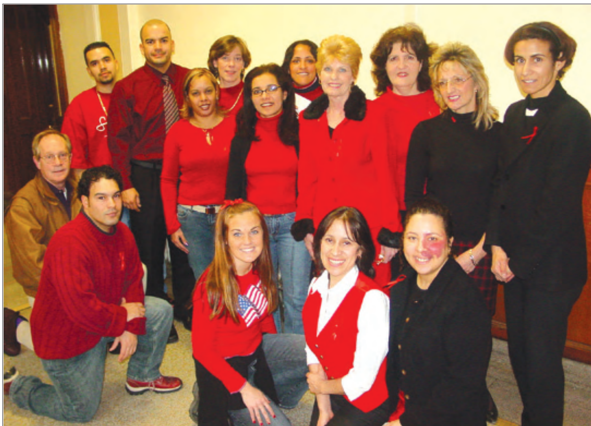
En el Ayuntamiento, algunos hombres se unieron a la campaña para mostrar apoyo a la mujer. En este grupo aparecen: