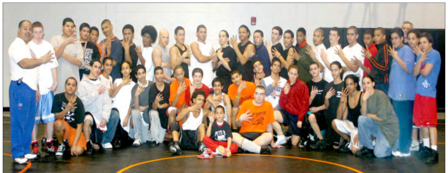
The members of the Greater Lawrence Technical School wrestling program signal their fourth straight Commonwealth Conference championship.