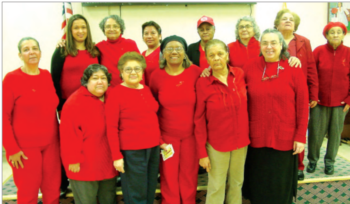
Voluntarias y clientas del Senior Center posan vistiendo de rojo en apoyo a la campaña en contra de las enfermedades del corazón.