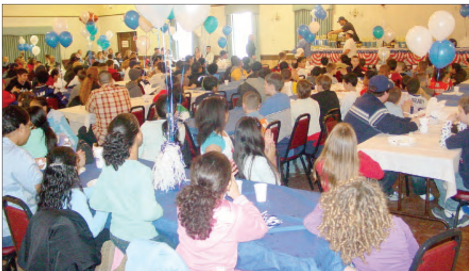
Partial view of the room full of players and parents.