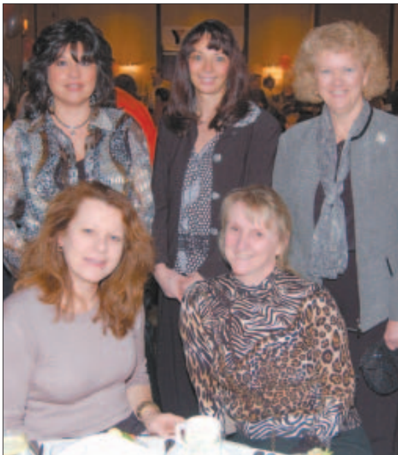
Enfermeras del Hospital General de Lawrence, pasando un buen rato: