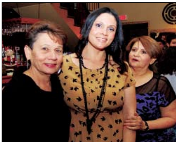
Miembros del Club de Así Canta Puerto Rico disfrutando de la fiesta.