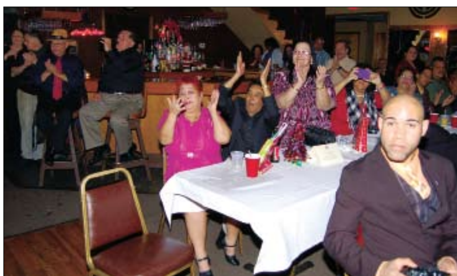
Miembros del Club de Así Canta Puerto Rico disfrutando de la fiesta.