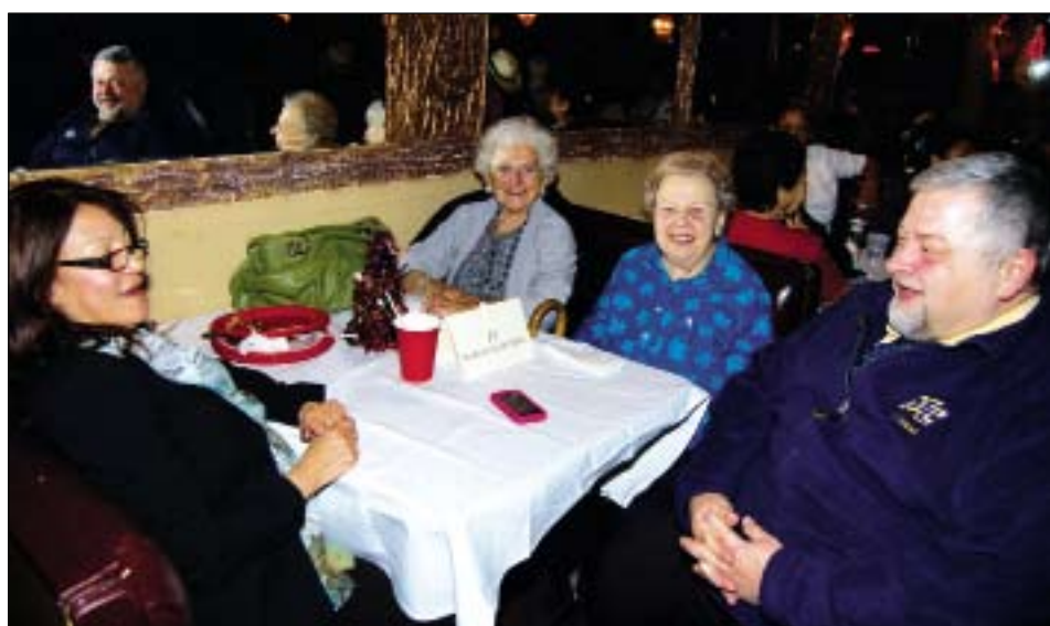
Hasta los lituanos disfrutaron de la música típica puertorriqueña. Even the Lithuanians enjoyed the Puerto Rican music!