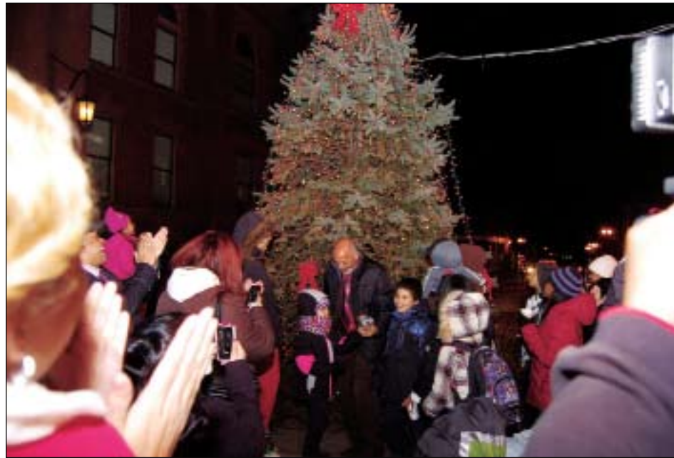
El Alcalde Lantigua utilizó dos voluntarios para encender el árbol Navideño.

Gracias de parte de Interfaith Caregivers y los muchos ancianos que necesitan de los servicios de choferes voluntarios para poder permanecer independientes en su propio hogar.