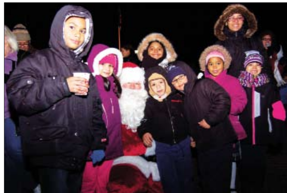
Grupo de niños quisieron retratarse con Santa.