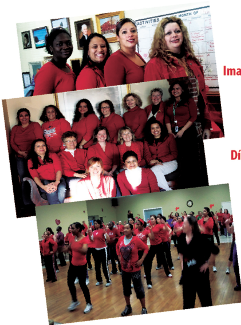
Images from last year's Wear Red Day in Lawrence ... Imágenes del Día de Vestir de Rojo del pasado año en Lawrence