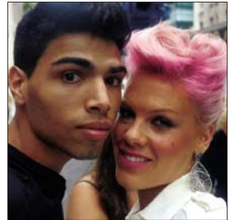
SonChild with Pink.